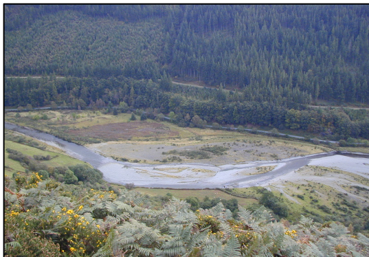
A modern meandering (warm climate) river

Images (all image copyrights: Dr Rob Hosfield, University of Reading. Reproduced with permission):