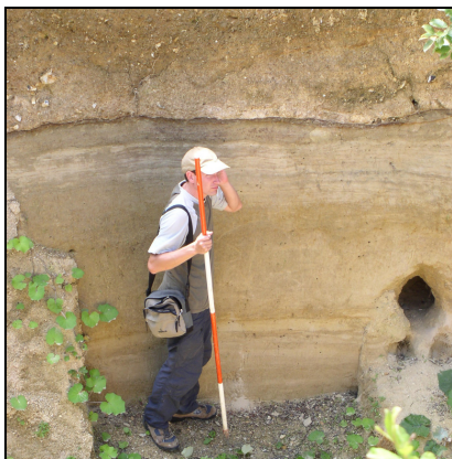
Fine-grained raised beach sediments at Boxgrove, including the soil horizon