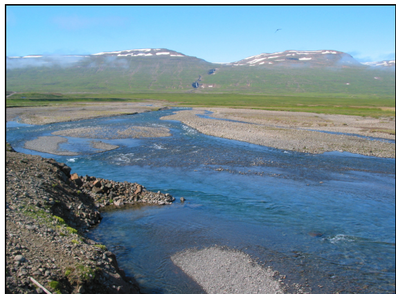
An example of a cold climate river from present-day Iceland